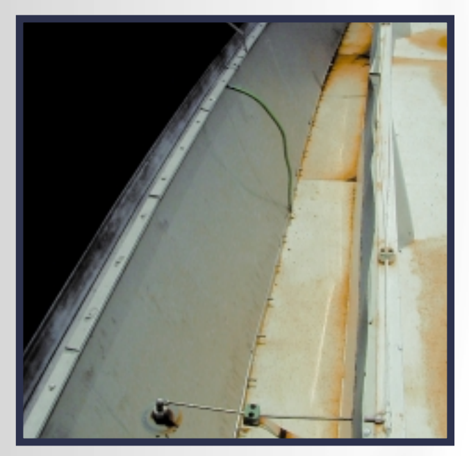
CTS20 secondary compression plate seal after installation, this particular seal is executed in SS316 with an extruded tip profile in a high aromatic content resistant rubber compound.

CTS is capable to install any tank seal on any tank, but our detailed drawings and installation manuals will give you the choice to have either your own staff or contractor staff installing the seal as well. The advantages of having your own (contractor) staff installing the system could be significant, reducing travelling and lodging costs. Experienced CTS supervision is available upon request.