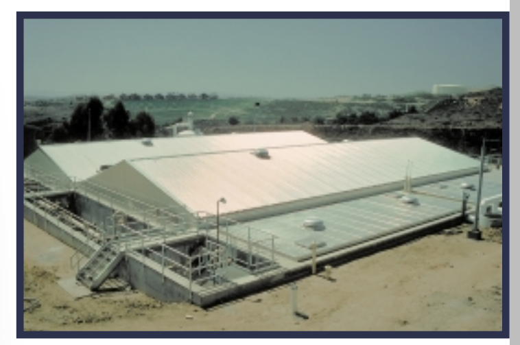
Trabuco waste water treatment plant, USA Batch reactor, truss roofs and aerobic digesters.