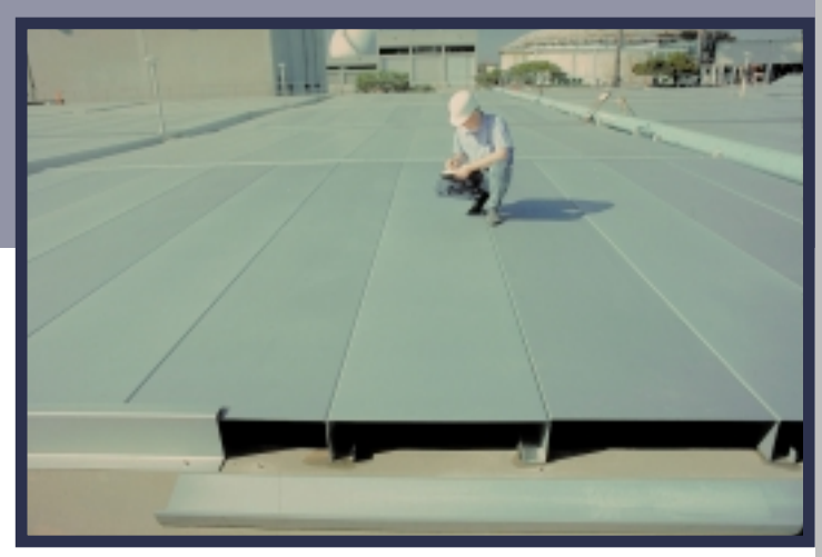
County Sanitation Districts, Orange County, USA ,Flat Covers for Sedimentation Basins.