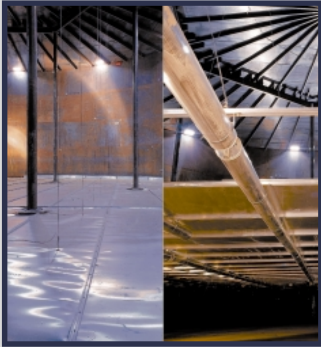
Cable suspended roof (no legs), top and bottom view.