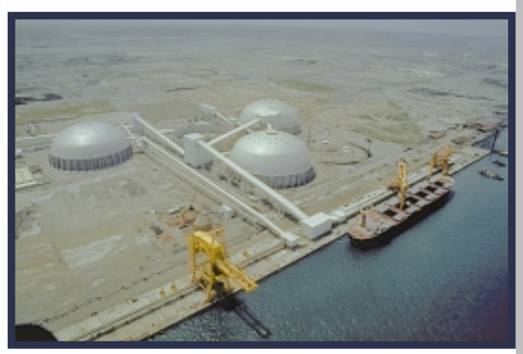
Completed 393' (120m) bulk storage domes after completion at FPC in Taiwan.

CARGO TRANSFER SYSTEMS B.V. Offices: Coventrystraat 2 3047 AD Rotterdam The Netherlands The Netherlands Tel.: +31 (0)10 - 2622160 Fax: +31 (0)10 - 2622190 E-mail: info@cargotransfer.net Website: www.cargotransfer.net