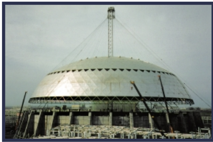
Bulk storage dome 393' (120m) under construction at FPC in Taiwan.