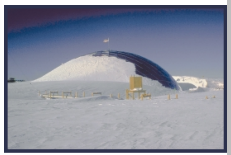
U.S. Navy South Pole 164' (50 meters), 300psf snow load (1465kg/m²).

CARGO TRANSFER SYSTEMS B.V. Offices: Coventrystraat 2 3047 AD Rotterdam The Netherlands The Netherlands The Netherlands The Netherlands The Netherlands The Netherlands The Netherlands The Netherlands The Netherlands The Netherlands The Netherlands The Netherlands